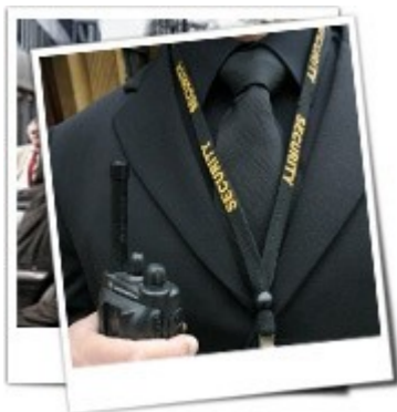
Adsec Group holds SIA Approved Contractor Status for the provision of Manned Guarding Services

The results of several compliance operations were reported in local press this month. The checks, conducted by us and various police forces, revealed unlicensed bar managers working at venues in Plymouth, Cockermouth and Barnsley. Bar owners, managers and anyone supervising and/or managing door supervisors must hold at least a non-front line SIA licence.